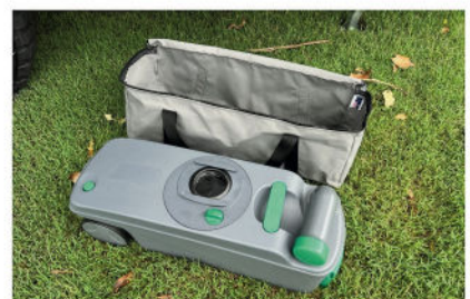
SECONDARY TOILET CASSETTE AND CANVAS CARRY BAG $450