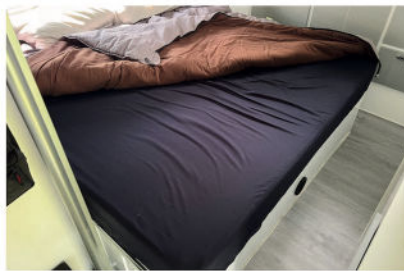
DOUBLE BED MATTRESS COVERS. SET OF 2. $225