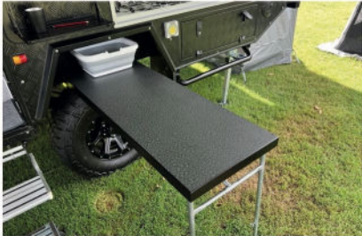
TABLE TO SUIT EXTERNAL KITCHEN CAVITY INC BAG $290