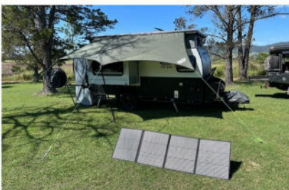
DRIFTA STOCKTON 200W FOLDING SOLAR PANEL $499