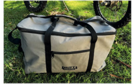
DRIFTA STOCKTON WEEKENDER BAG $99