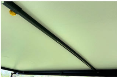
CURVED LED SPREADER CARAVAN AWNING POWER POLE 1400 $129