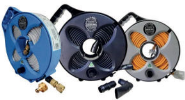
FLAT OUT MULTI-REELS: 10M WATER, 6M SULLAGE & COMPACT REEL FOR POWER CORD $449