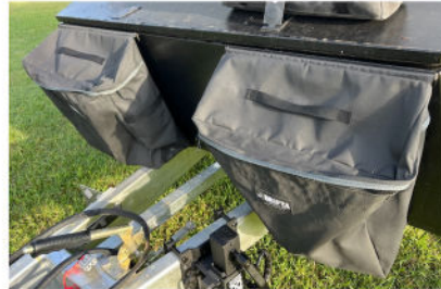
DRIFTA CANVAS SAILTRACK TOOLBOX BAG $199