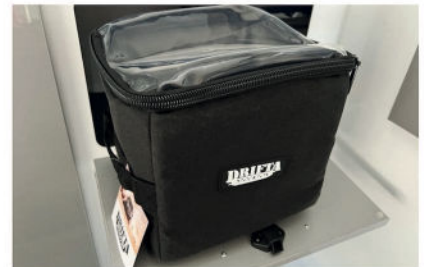
DRIFTA STOCKTON HALF LENGTH DRAWER BAG $49