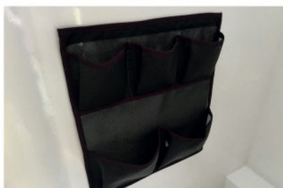
DRIFTA BATHROOM TOILETRY & SHAMPOO HOLDER $49