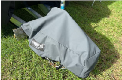
DRIFTA CANVAS DRAWBAR COVER $159