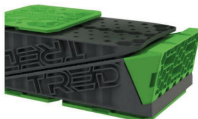
TRED GT LEVELLING RAMP WITH CHOCK (PAIR) $139