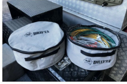
DRIFTA CANVAS CLEAR TOP POWER CORD BAG $57