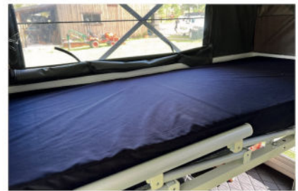
SMALL BUNK MATTRESS COVER $139