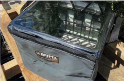
2 X CANVAS CLEAR TOP MILK CRATE BAGS - BARRINGTON GREY $120