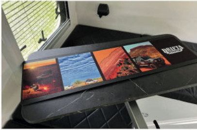
DRIFTA STOCKTON BAR MAT $34.90