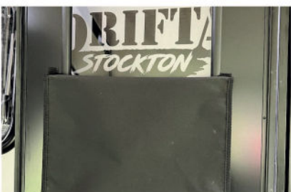
CANVAS DOOR BLOCKOUT $50