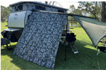
CANVAS SIDE WALL & CURVED SPREADER BAR (NO LED) $200