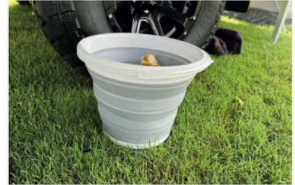
COLLAPSIBLE BUCKET WITH HANDLE $27.90