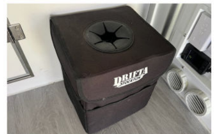
DRIFTA STOCKTON RUBBISH BIN BOX $59