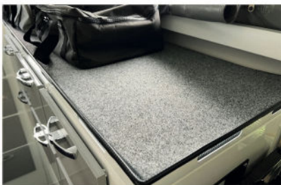
CARPET STEP AND CARPET INFILLS FOR ABOVE CUPBOARDS $150