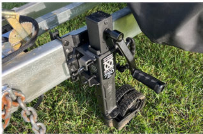
ARK XO JOCKEY WHEEL $490