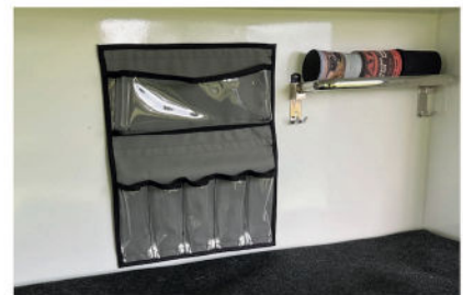
DRIFTA KITCHEN UTENSIL HOLDER WITH VELCRO $49