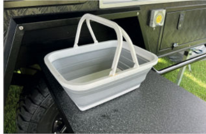
COLLAPSIBLE TUB WITH HANDLE $27.90