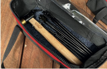
DRIFTA STOCKTON LARGE HAMMER & PEG COMBO $139