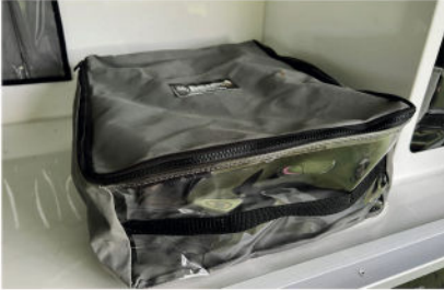
DRIFTA CLEAR END BAG FOR KITCHEN - TOP PANTRY $50