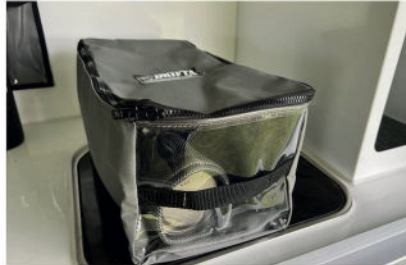
DRIFTA CLEAR END BAG FOR KITCHEN - SIDE PANTRY $50