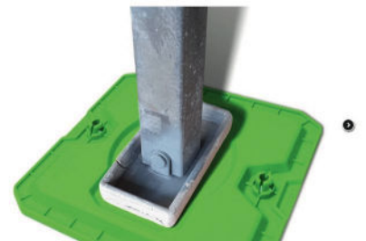
TRED GT ANTI SINK PLATE - 4 PACK $44.95