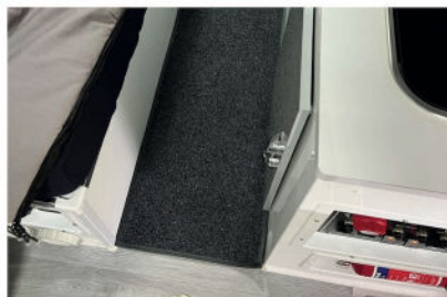
CARPET FLOOR FOR END OF BED $90