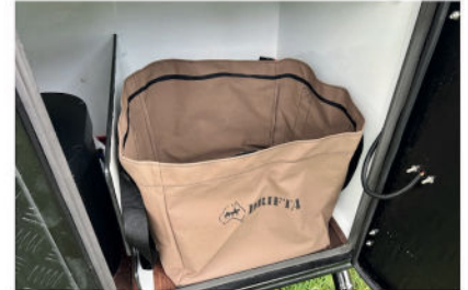
OPEN TOP MILK CRATE BAG TO SUIT EXTERNAL STORAGE CAVITY $57