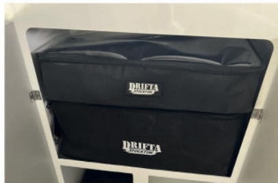
DRIFTA STOCKTON HALF HEIGHT DRAWER BAG $49