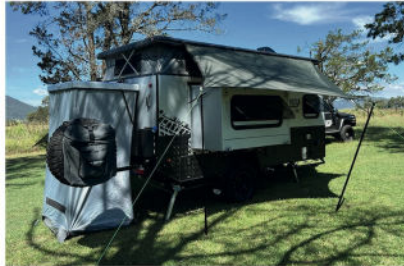
KIT OF 2 X HALF MEDIUM HEXA TARPS. INCLUDING: 1 X 5 MM KEDDER, 1 X 8 MM KEDDER AND FREE GREEN & BLACK ROPE RATCHETS $550