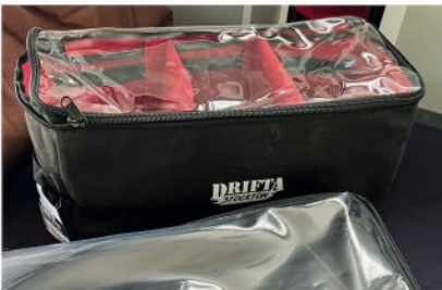
DRIFTA STOCKTON PREMIUM DRAWER BAG $59