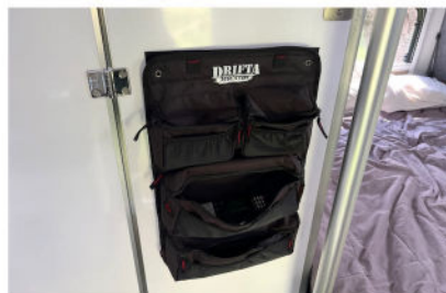
DRIFTA STOCKTON 4 POCKET ORGANISER - WITH VELCRO MOD $154