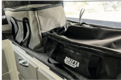
DRIFTA STOCKTON OVERNIGHT BAG $89