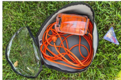
AMPFIBIAN RV-PLUS 15AMP TO 10AMP POWER ADAPTOR $139