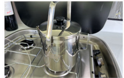
DRIFTA STOCKTON CAMPING KETTLE 2L $39