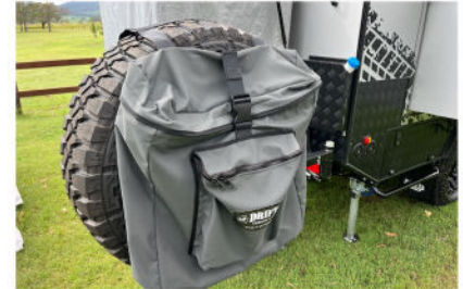
DRIFTA CANVAS WHEEL BAG COVER $275