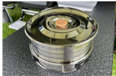
DRIFTA STOCKTON MEDIUM STAINLESS COOKSET $149