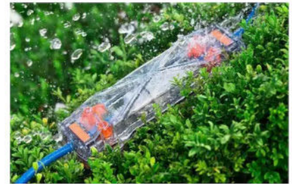
AMPFIBIAN WEATHERPROOF CONNECTOR PROTECTOR $29.90